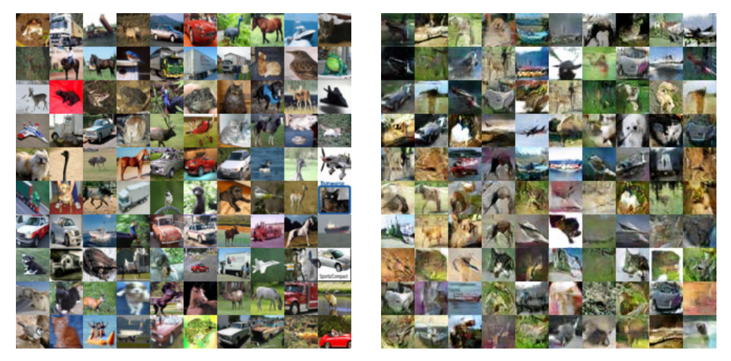
(a) Original images (b) Generated images Fig. 4. Samples of (a) original images and (b) GAN-generated images from the CIFAR-10 dataset

CIFAR-10 is an established computer vision dataset used for testing object recognition. It consists of 60,000 32*32 color images containing 1-10 object classes, with 6,000 images per class. The CIFAR-10 dataset is split into six batches, each with 10,000 images containing about 1,000 randomly-selected images from each image class. We separated the CIFAR-10 dataset into five batches for training and one batch for testing. Fig. 4 compares sample CIFAR-10 and GAN-generated images.