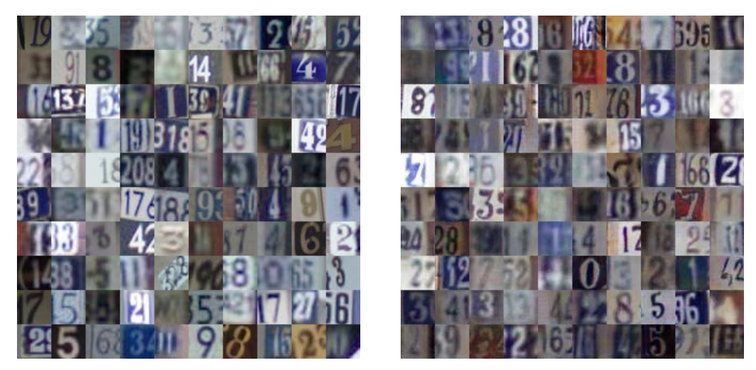
(a) Original images (b) Generated images Fig. 3. Samples of (a) some original images and (b) GAN-generated images from the SVHN dataset

SVHN is a real-world dataset for evaluating image recognition performance, with 73,257 training points and 26,032 test points. Fig. 3 show samples of actual SVHN and GAN-generated data.